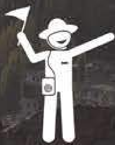
Driver cum Guide