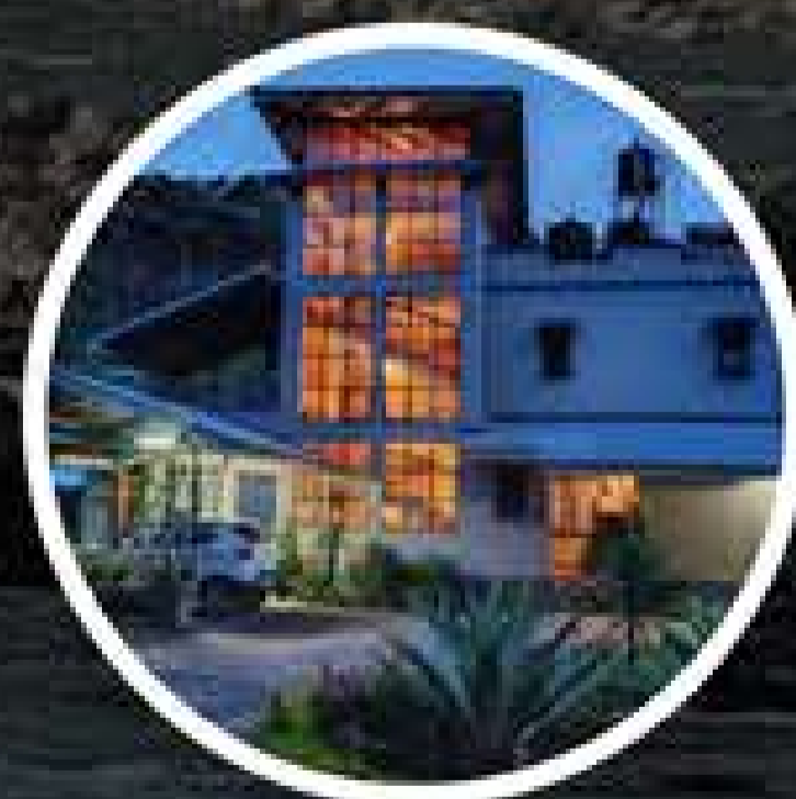
Keeduk Inn Dirang