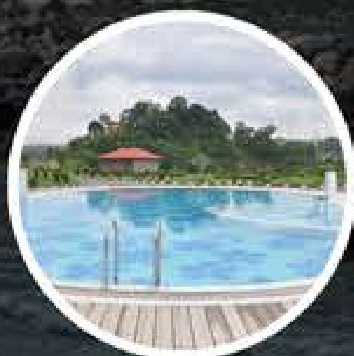
Waii International Itanagar