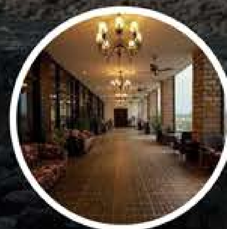
Greenwood Hotel Tezpur