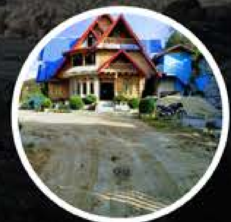
Siiro Resort Ziro