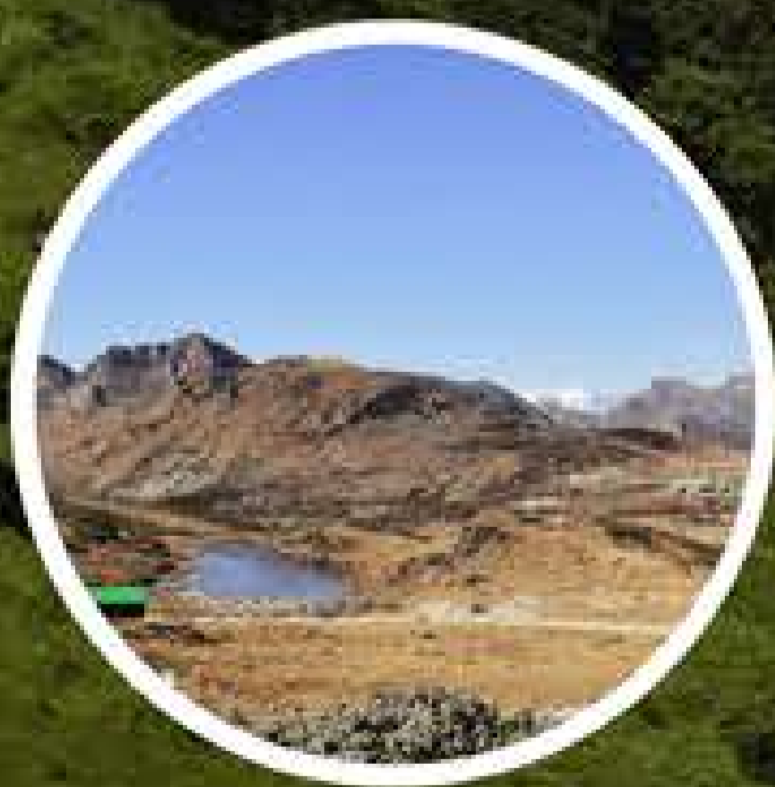
Bum La Pass