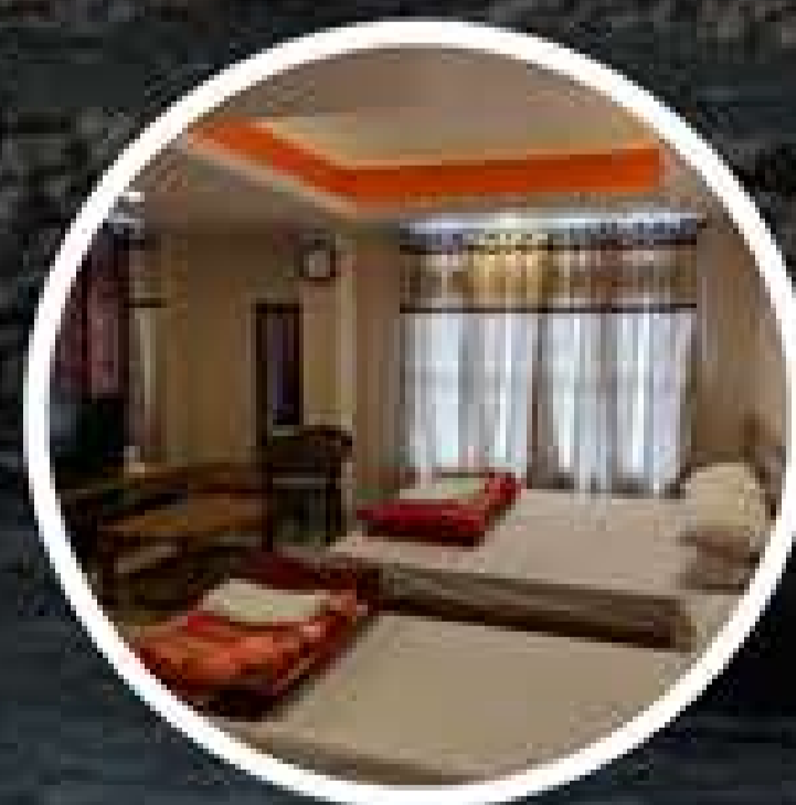
Hotel Grand Bomdila