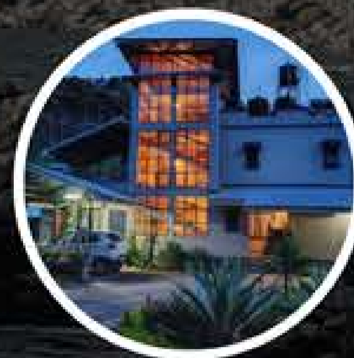
Keeduk Inn Dirang