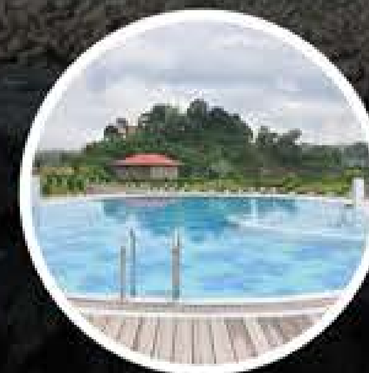
Waii International Bhalukpong