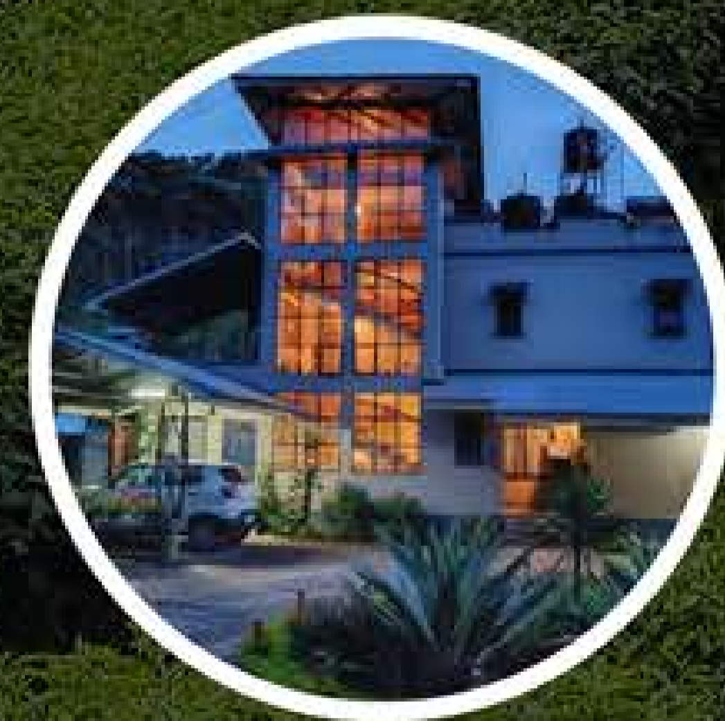
Keeduk Inn Mon