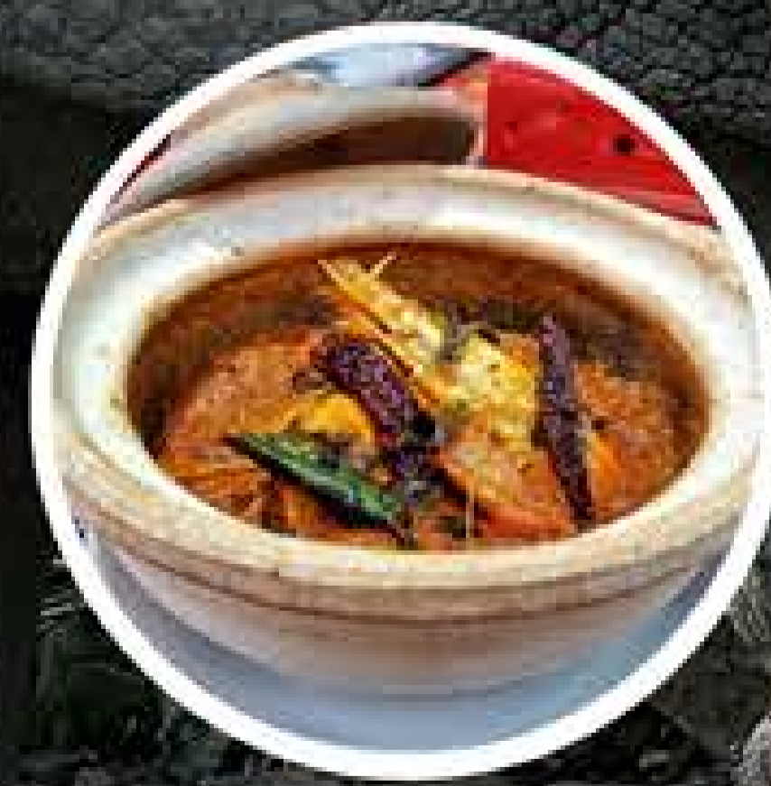
Experience Assamese Cuisine