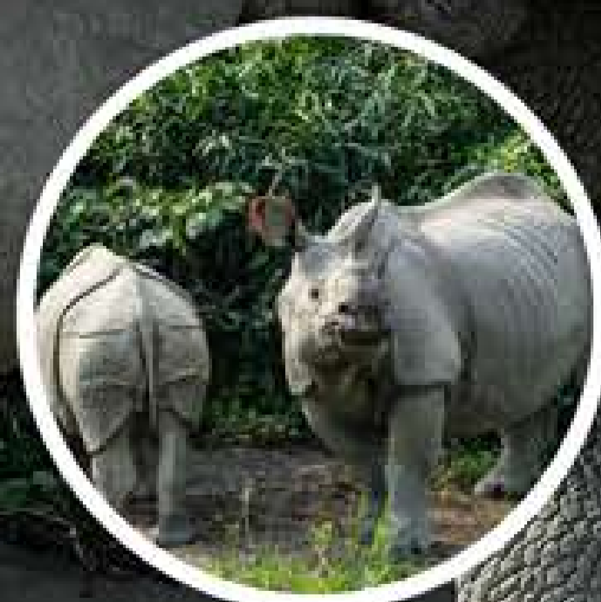
Kaziranga National Park