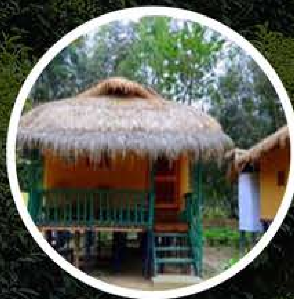
Siiro Resort Ziro