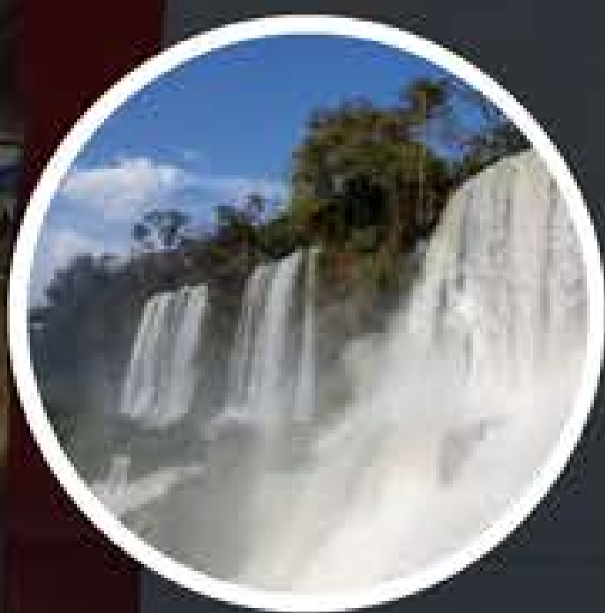
7 Sister Falls