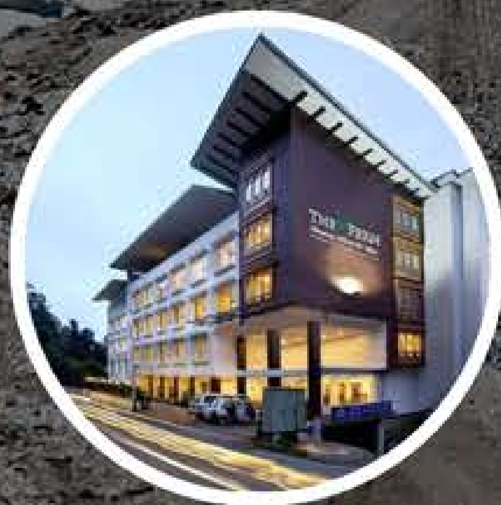
The Fern Gangtok