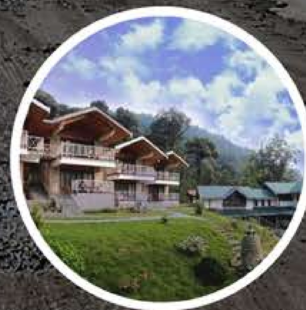
Magpie Hotels Pelling