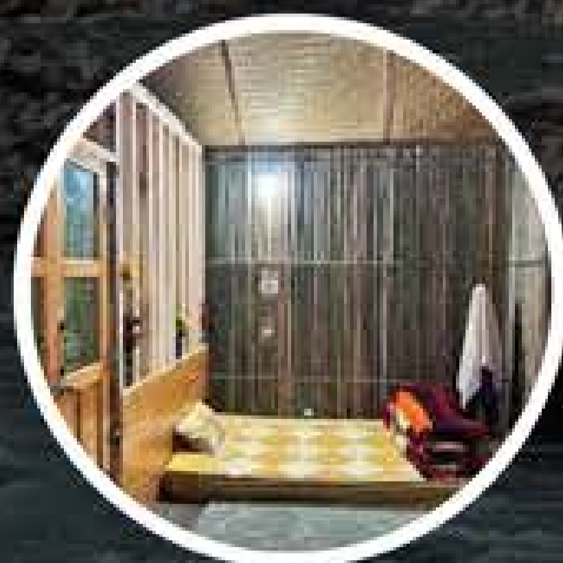
Kongo Homestay Anini