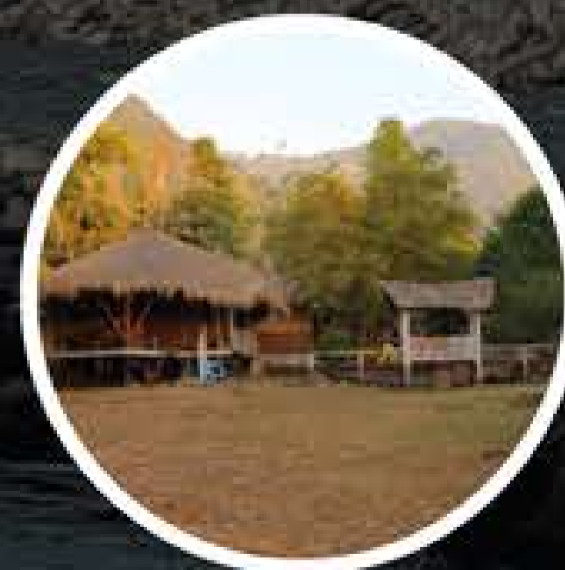
Mishmi Hills Homestay Roing