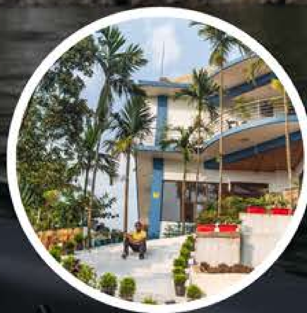
Royal View Resort Cherrapunji