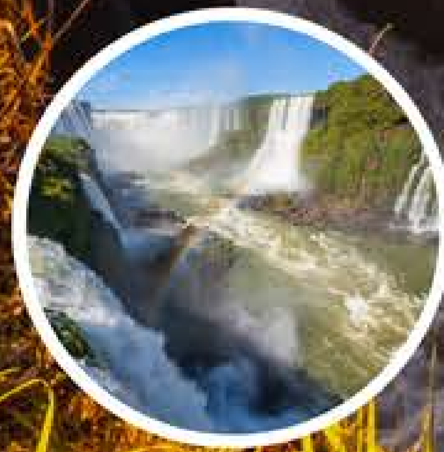
Rainbow Falls Trek