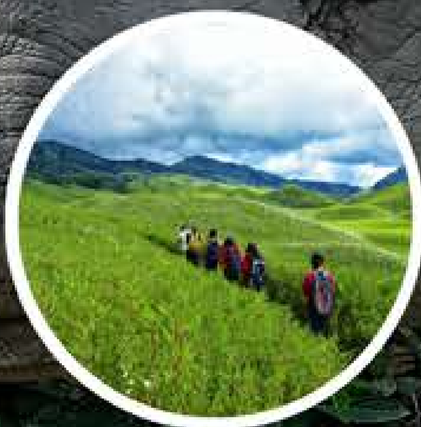
Dzukou Valley Trek