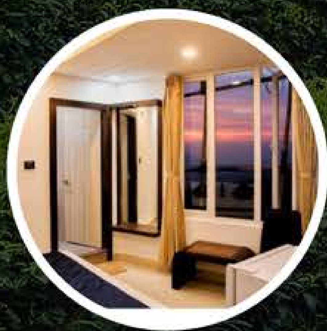
Crescent Hotel Kohima