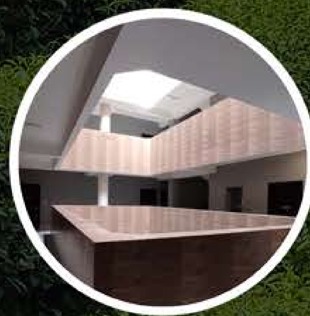
Hotel Cedar Dimapur