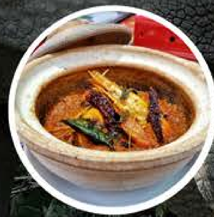
Experience Assamese Cuisine