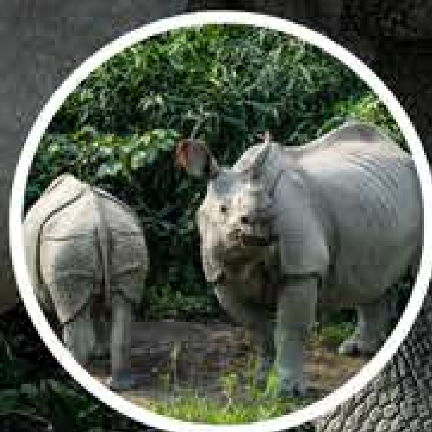
Kaziranga National Park