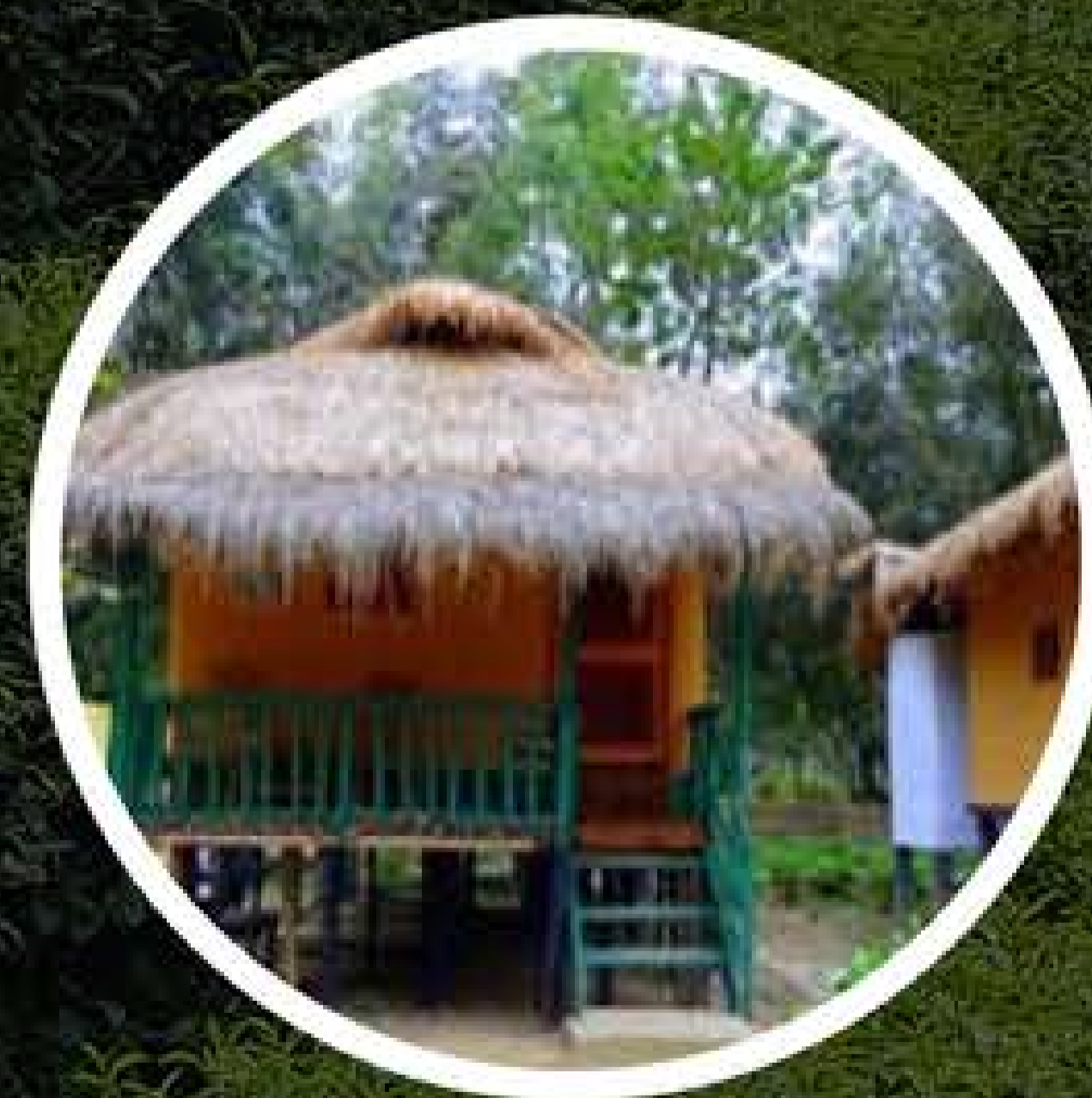
Nature Hunt Kaziranga