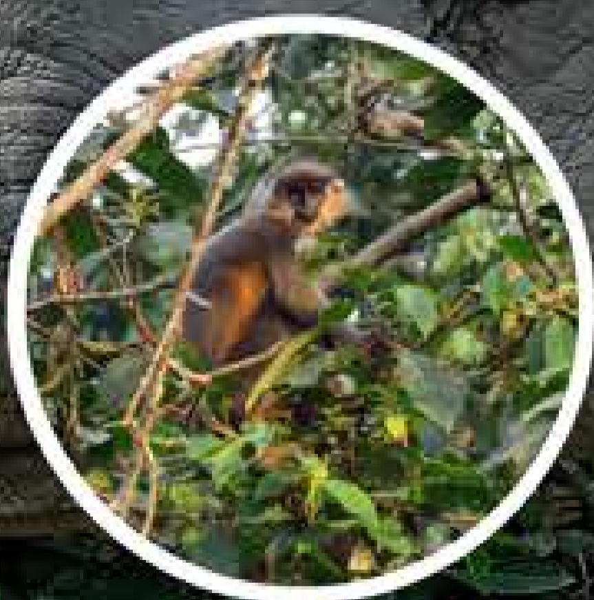
Nameri National Park