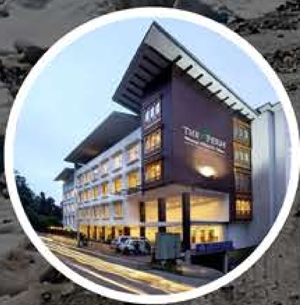
The Fern Gangtok