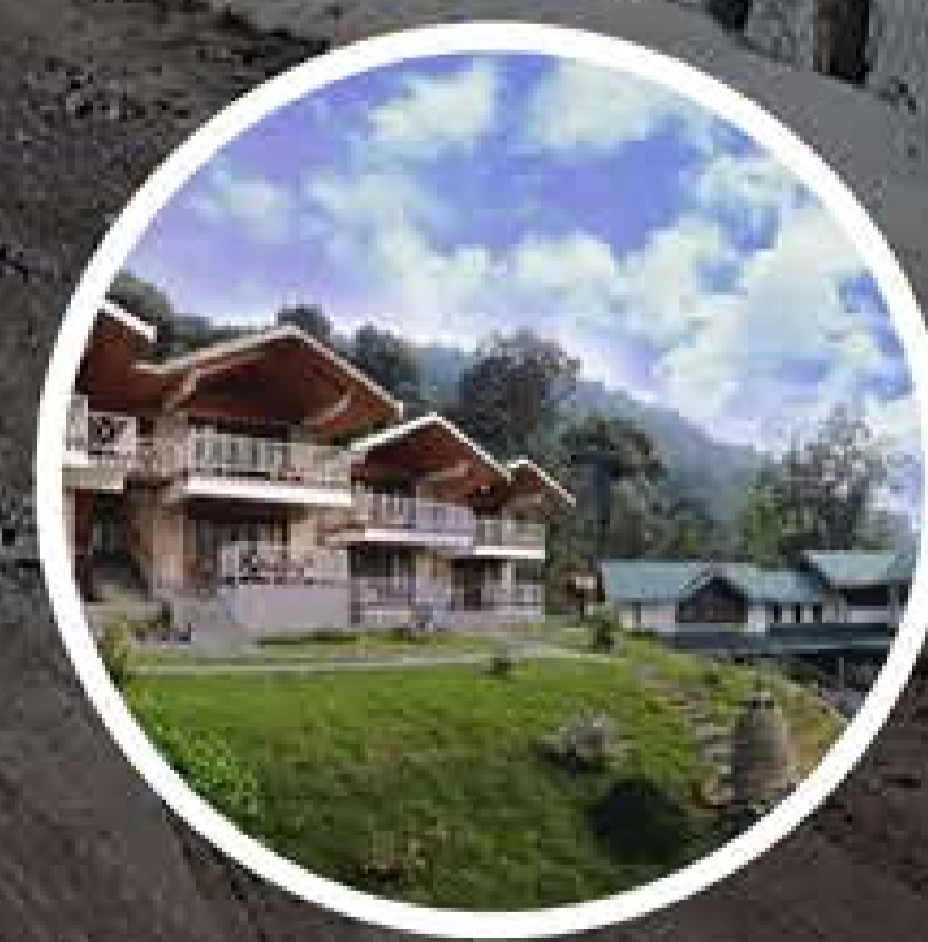
Magpie Hotels Pelling