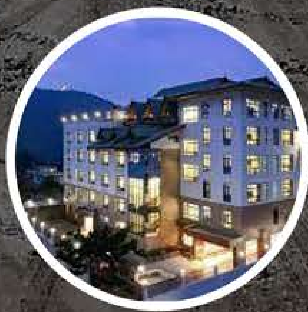
Sobralia Hotels Namchi