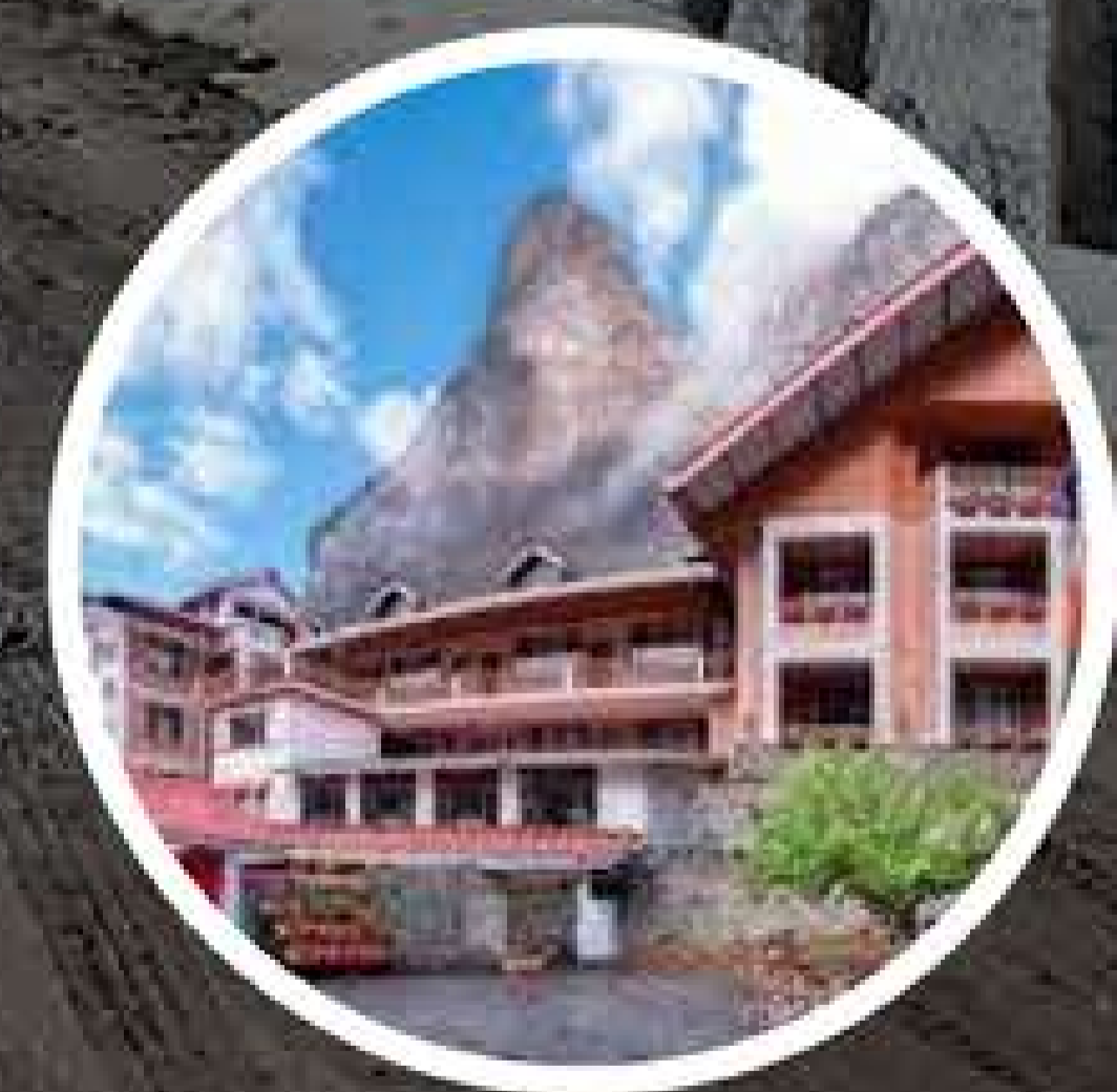
Yarlam Resorts Lachung