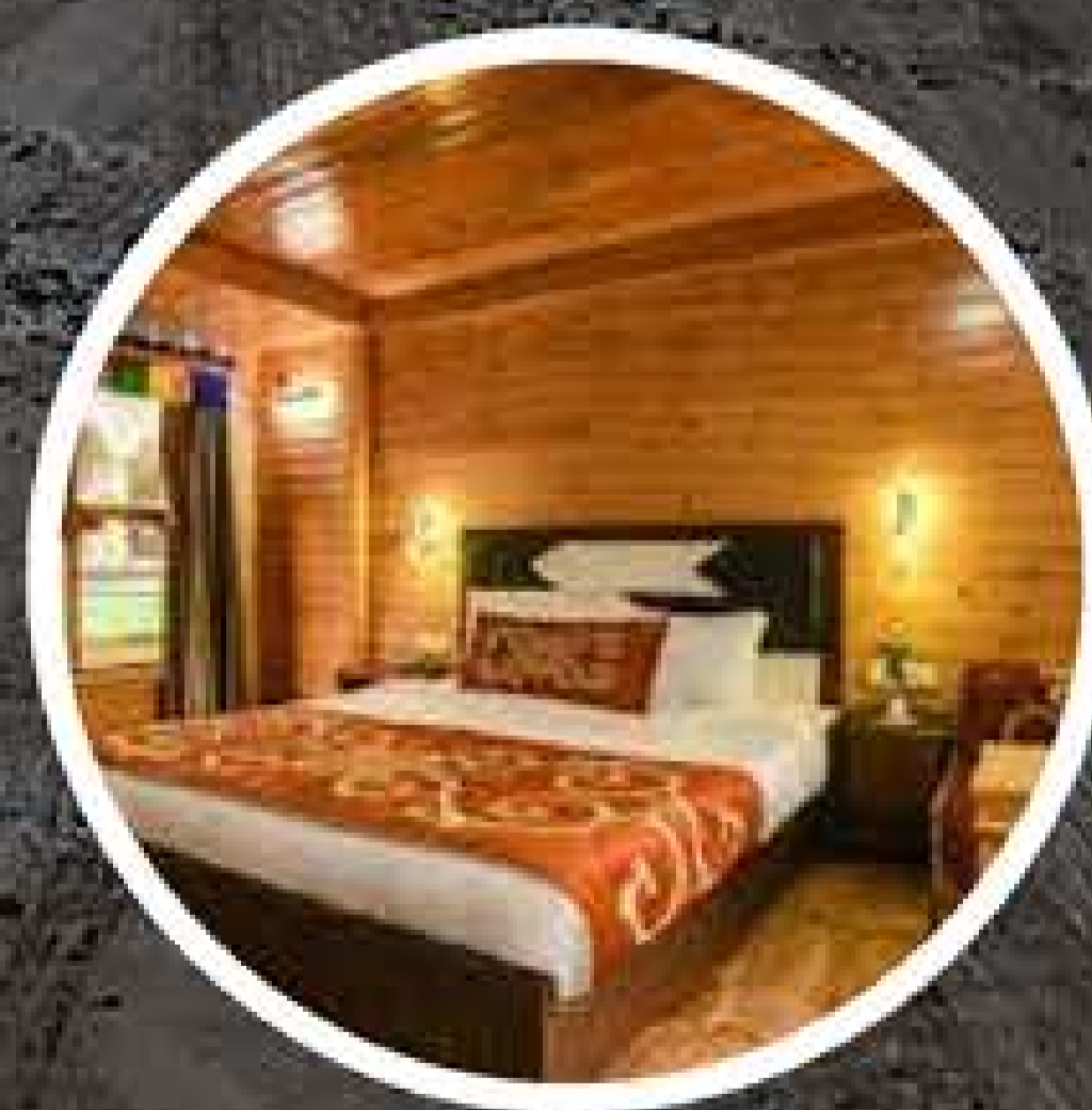
Summit Hotels Lachen