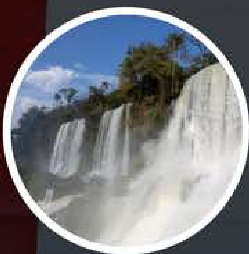
7 Sister Falls