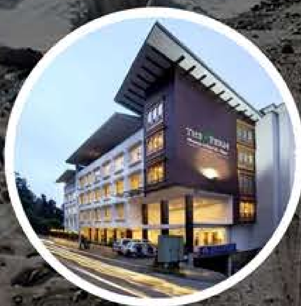
The Fern Gangtok