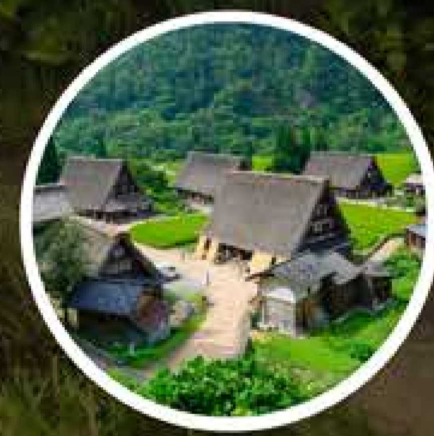
Explore Longwa Village