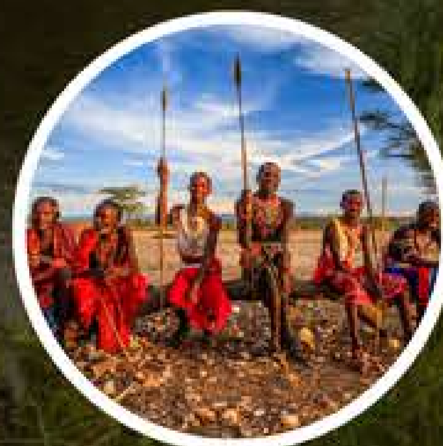
Interact with Konyak tribe