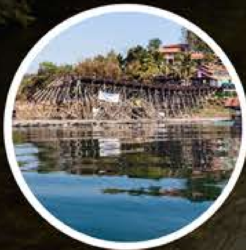
Explore Mon Village