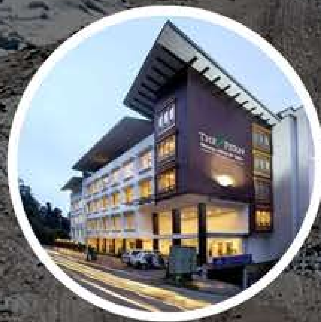
The Fern Gangtok