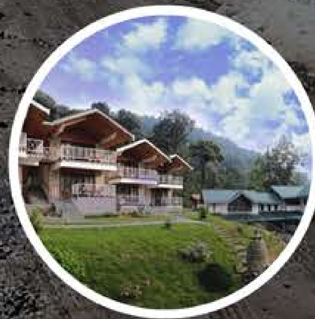
Magpie Hotels Pelling