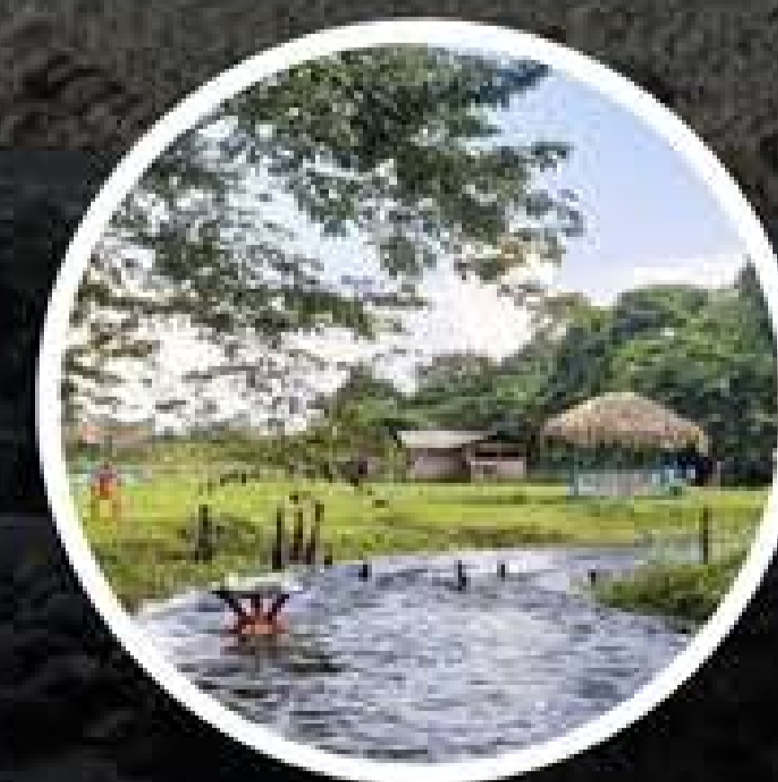
Digaru Eco Resort Tezu