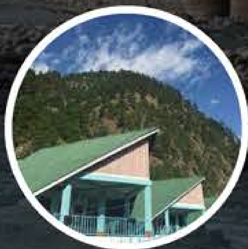
Dong Resort Dong