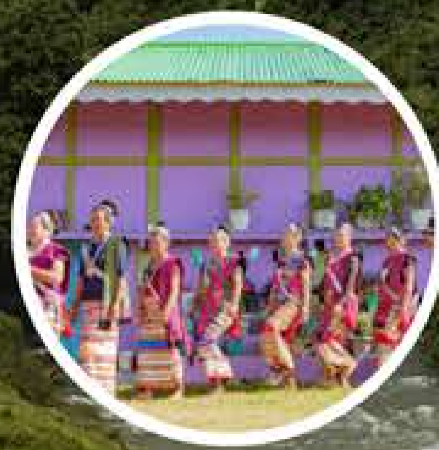
Wakro local culture