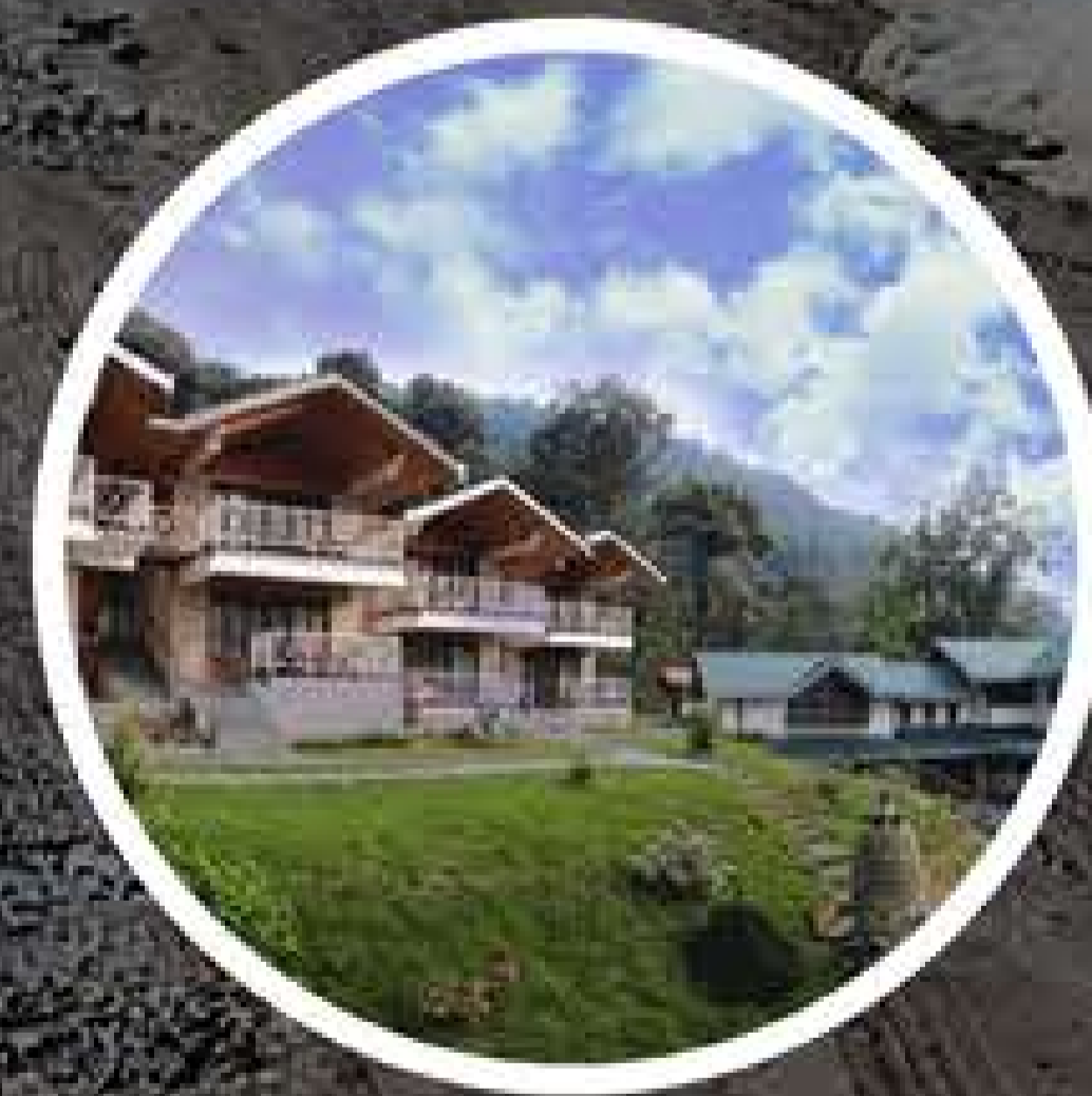
Magpie Hotels Pelling