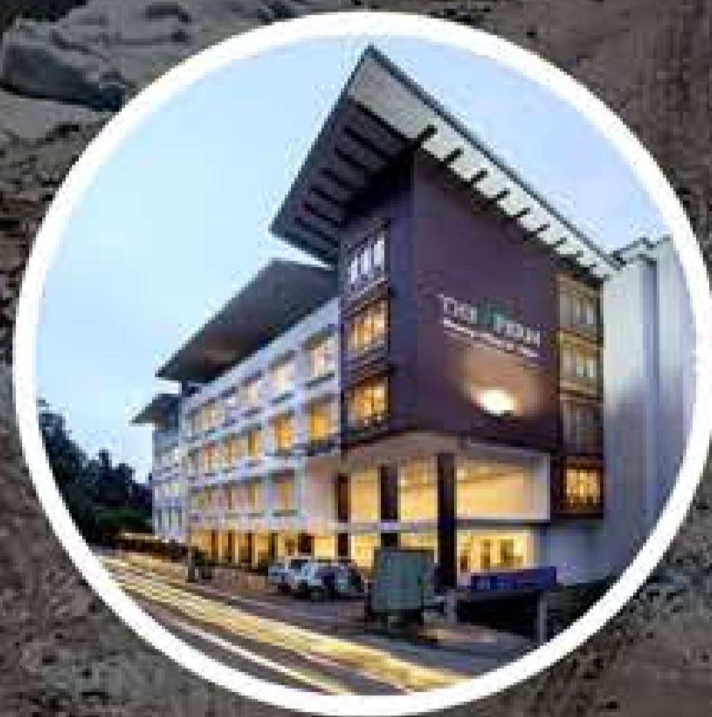
The Fern Gangtok