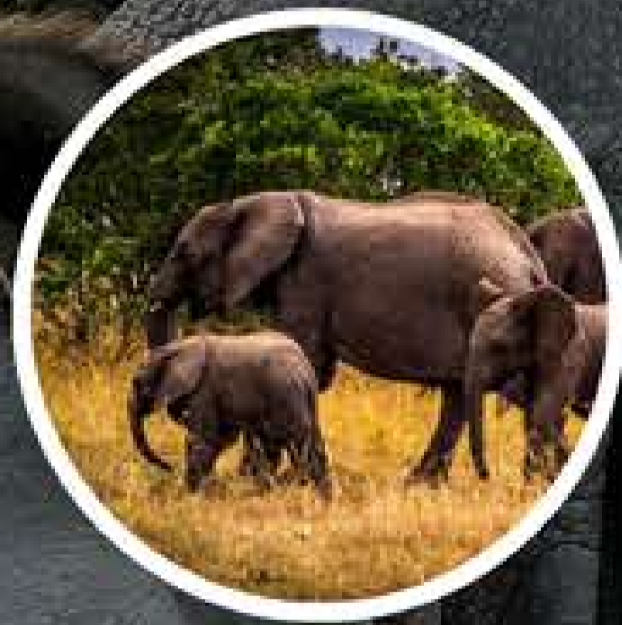
Nameri National Park