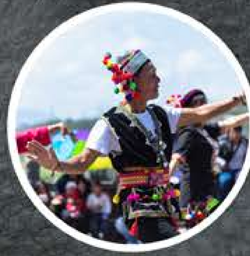
Enjoy Folk Dance