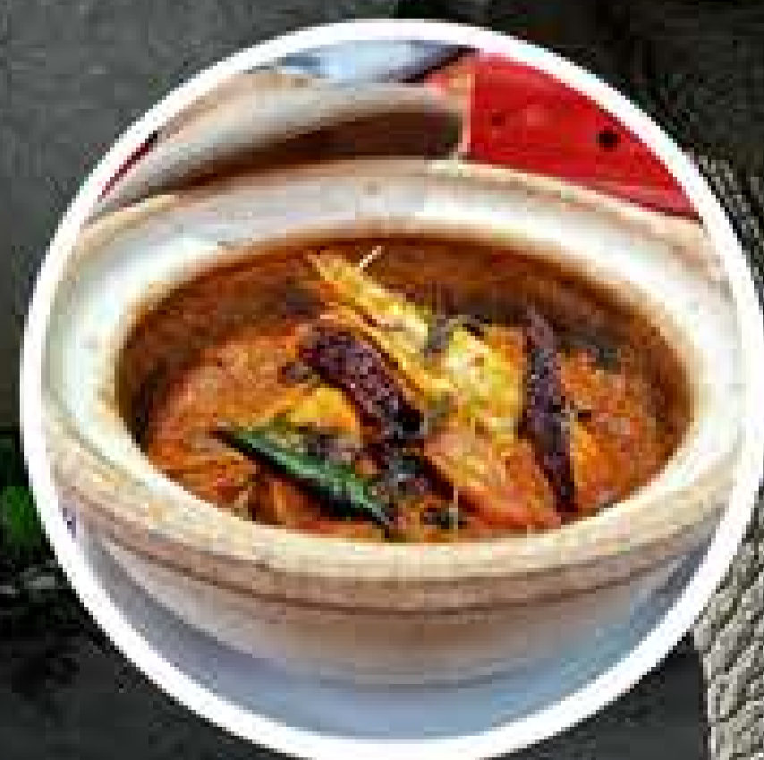
Experience Assamese Cuisine